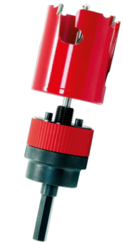
Pilot Drill use in PlugX UNI-Arbor